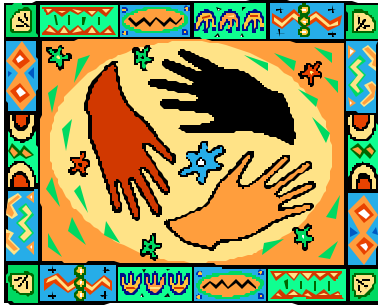
Diversity and Trust "Deal with it!"