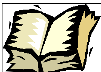
Check the City Code for help with neighborhood issues and deed restriction problems

Neighborhood Services is currently accepting applications for 2005 Neighborhood and Home Recognition Program. The Neighborhood and Home Recognition Program exists to celebrate the uniqueness of Clearwater's many neighborhoods and its residents. The City of Clearwater would like to recognize those neighborhoods and residents that make a commitment each day to improving the quality of life for all residents in Clearwater. Please fill out and submit our new application. Paste to browser: http://www.myclearwater.com/gov/depts/devel_svc/NeighborhoodServices/pdfs/award_form.pdf