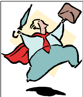
CNC MAN , SUPERHERO! "Here he comes to save the day"

Time to take a break for the summer. No meetings in July or August. Our next meeting is September 13th. ENJOY YOUR VACATION!